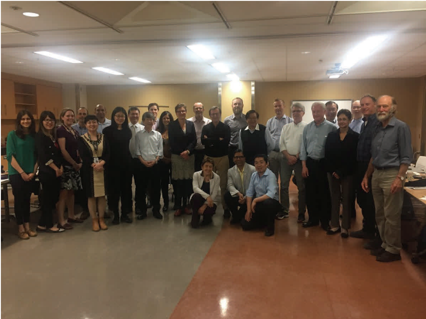
iNeo Face-To-Face Meeting (May 3-4, 2018) Photo